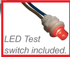
LED Test switch included.