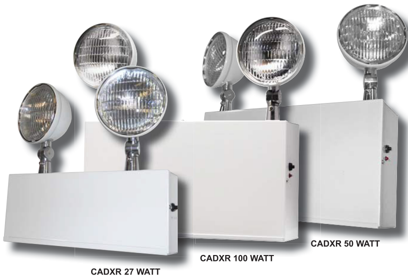
CADXR 27 WATT