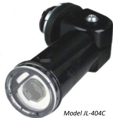
Model JL-404C (Pencil Type Photocell)