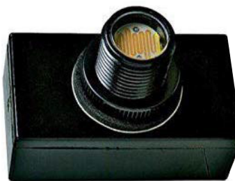
Model JL-403C (Button Type Photocell)