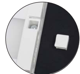
Pre-positioned installation screws