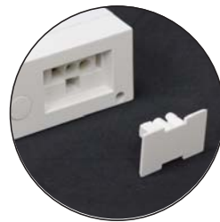
Link several undercabinets together with the Linkable Connector Wire